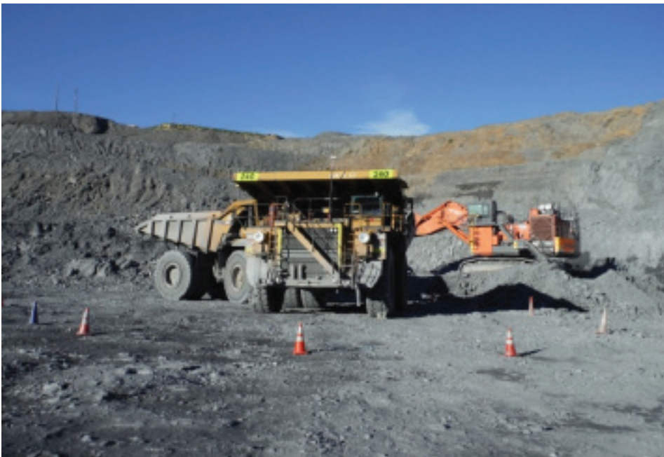
FIGURE 1: Truck contact in loading zone

Dump truck two was queuing and its driver thought the first truck was leaving the loading zone and proceeded to drive into it. The two trucks then collided. No one was hurt but substantial damage occurred to the trucks.