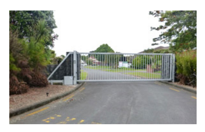
FIGURE 1: The gate when closed

The gate had no safety devices to protect people from injury as it opened. These devices are designed to detect obstructions such as objects and people, stop the gate, and force it to move in the opposite direction so the object or person is released.