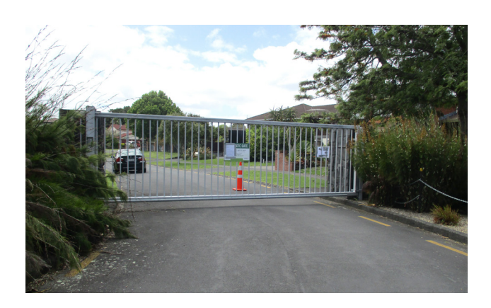
FIGURE 2: Child, represented by cone on other side of gate, was playing near gate housing (left in front of wall). As the gate retracted towards the left side, the child was drawn into gate housing