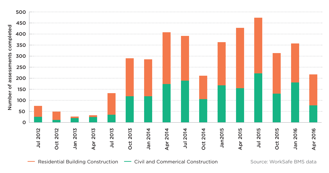
FIGURE 3: Quarterly assessment activity data in Canterbury (residential versus civil and commercial) (June 2012-June 2016)

Construction industry foremen, workers and company directors were asked about their experiences engaging with WorkSafe inspectors. Many perceived that compared to other areas they had worked in, WorkSafe inspectors were more visible in greater Christchurch and carried out more enforcement. Many also perceived that inspectors were more visible in the CBD than in residential areas. This is an expected finding as the NSW inspectors targeted the CBD, due to the large amount of demolition work and higher risk associated with the demolition, reconstruction and new build work in the CBD. However, the assessment data available shows that there were still a large number of residential building inspections during this period (see Figure 3); at times the two areas were at similar levels of inspection and at other times residential building assessments were greater than civil and commercial. A limitation of this data is that demolition work cannot be broken down further into residential and commercial, meaning that the other construction category may obscure the level of activity in both areas. As can be seen in Figure 4, there was a large amount of construction activity assessed that fell into the other category, which could be commercial and civil or residential.