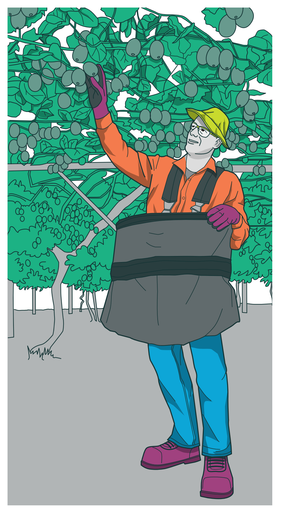
FIGURE 3: PPE for head, torso and arms

For more information about PPE, see WorkSafe's webpage Personal protective equipment (PPE)