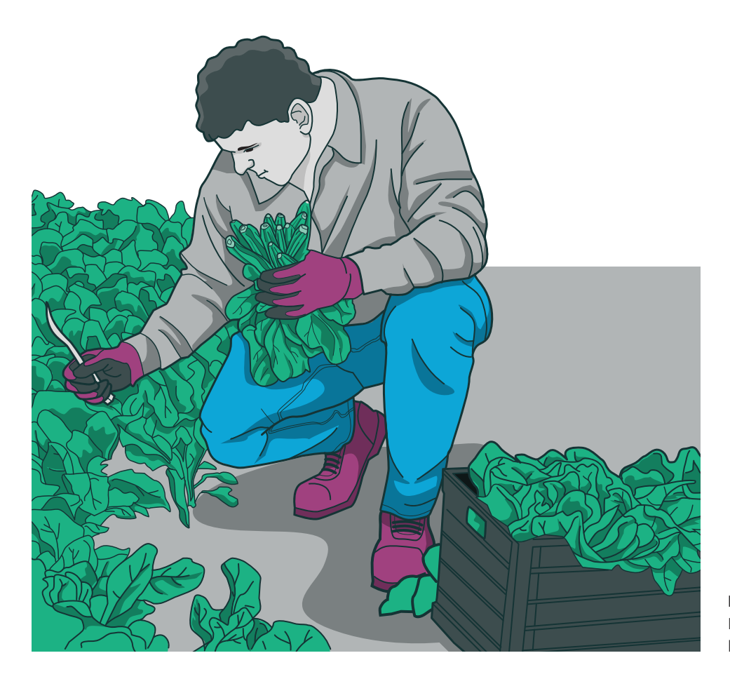
FIGURE 2: PPE for hands, legs and feet

People should wear PPE that covers hands, legs and feet (at minimum) for most activities carried out in application areas during an REI.